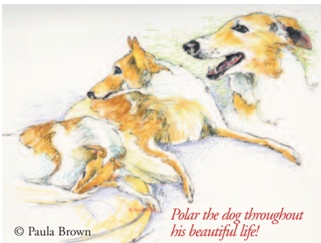
© Paula Brown Polar the dog throughout his beautiful life!

“Fur Shui” also sends you all best for Spring! It is good to do a clean sweep, get rid of clutter (who knows, you may find room for an extra fur folk!), and let in new clean energy into your environment and home. Check out the 2nd release of Fur Shui now in larger format and Kindle! To purchase, click the green dot: www.furshui.com