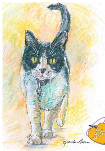
Remembering Noble the Kona Stories Bookstore cat! with my Pet Essence portrait...such a BIG LOVE!