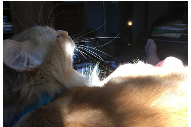
My cat Rumi, starting to do the “Fall” relaxation...ahhhhh...

Time for another “shift”, this time it's the seasons. For us in the “North”, things begin to slow down a bit, nights get cooler, days crisper. Plants and trees are slowing down, as sunlight decreases, to get ready for the colder season ahead. Asters and chrysanthemums bloom beautifully as orange pumpkins and corns mature. Notice the arc of the Sun across the sky each day as it starts shifting south. Birds and butterflies migrate along with the path of our Sun! Fall is my favorite season, leaf peeping, hiking, fresh air. Lots of “sites” to go celebrate the equinox from the Mayan pyramid Chichen Itza, Mexico, to Stonehenge in England. An interesting Farmer's Almanac story on Equinox and Solstice “5 ancient hot spots”: https://www.almanac.com/content/five-ancient-sites-aligned-solstice-and-equinox